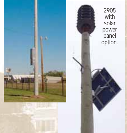
2905 with solar power panel option.