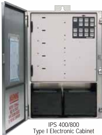
IPS 400/800 Type I Electronic Cabinet